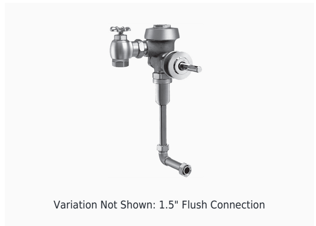
Variation Not Shown: 1.5" Flush Connection